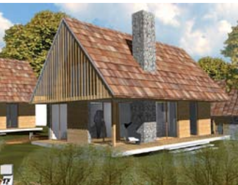
“apart settlement TOPOLŠICA” 2007 19 architecture: KLUN AMBIENTI with architect colleagues Janežič and Šifrer