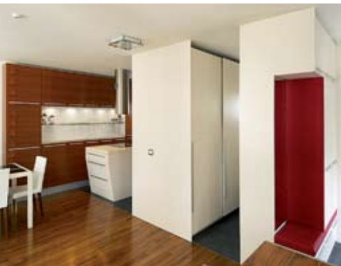
“project EKO twin” 2005 architecture: KLUN AMBIENTI with collaborators