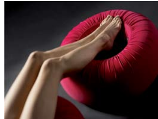
"Ringg K39" _the seat is IMAGINATION. Design: KLUN AMBIENTI 2006