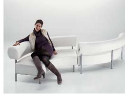
"Lunna K09" _padded dreams in the line, or... Design: KLUN AMBIENTI & BeBe Studio 2005

All KLUN products are made in the context of functional aesthetics, and for each we say with proud: "I wish to have this seating sets at my HOME."