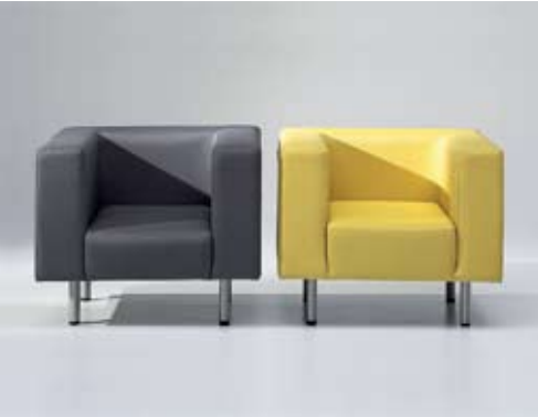
KLUN catalogue model “Young K07” design and execution KLUN AMBIENTI