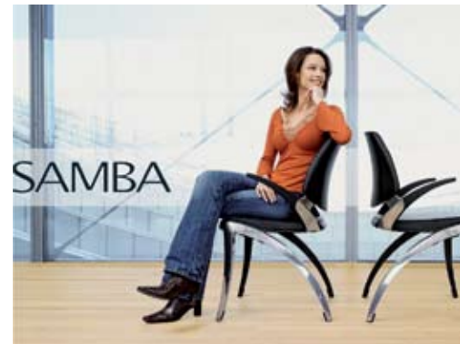
“SAMBA” _conference chair, model 2006 All vital parts are aluminium.