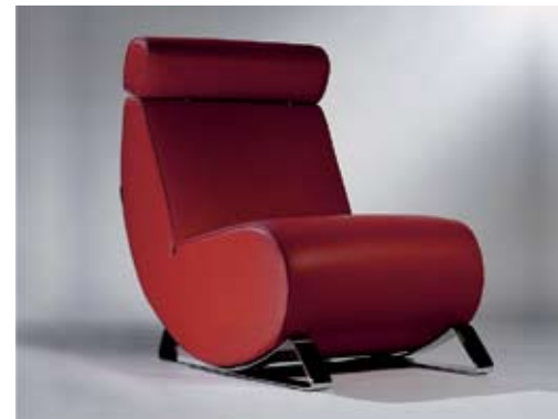
"Nota design K" Deign: KLUN AMBIENTI 2003