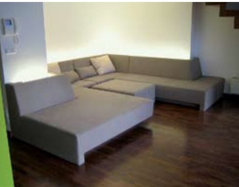
KLUN model “Project PRIVAT”, 2006 design by KRUŠEC architects, execution KLUN AMBIENTI