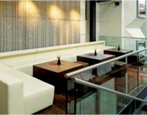
“GG Rožmarin MB”_KLUN products after the project by the arch. Interior: AKSL architects

We have, for architects and designers, a CAD library of all the 30 models, which can be found in our regular KLUN handwork program.