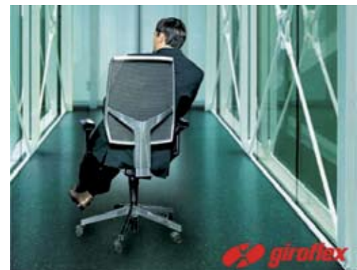
“Athos, Aramis G68” _ergonomic work chair Adaptable quality and appearance in the working environment.