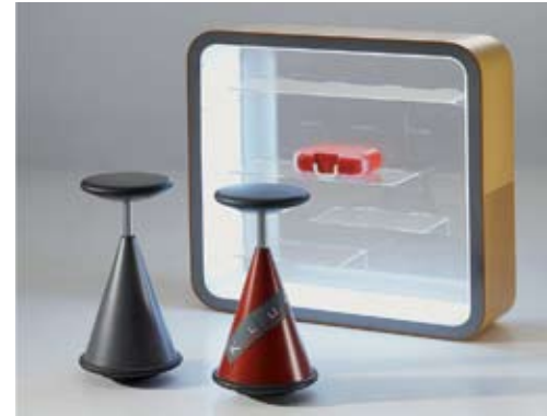
“Informator + LuC _0E102 promo” _choice BIO 20design by the architects Peter Pavšič and Robert Klun

Confide in the architectural atelier and the trademark of the KLUN AMBIENTI padded furniture, present yourselves with oases of comfort: top-notch sofas and other interior fittings.