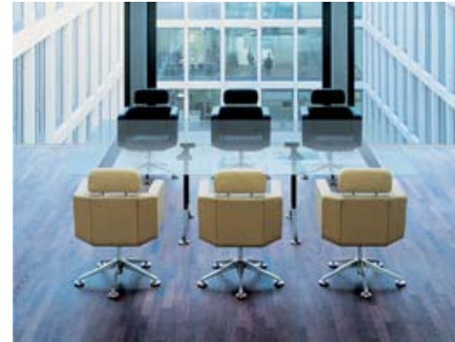
“TANGO giroflex” _model of a contemporary rest seat or conference chair with adaptability