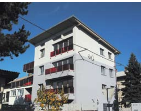
“Project villa-block” 2004 architecture: KLUN AMBIENTI with collaborators